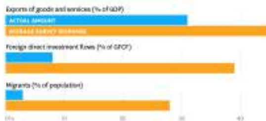
Figure 2: Extent of Globalization

President-elect Trump's triumph can be attributed to the emptying out of fundamental assembling in the American heartland. This has mixed profound disdain among prevalently white people (more white ladies decided in favor of Trump than Clinton) in influenced networks. A decision in favor of Trump was a vote against standard lawmakers and their elitist supporters just as remote interests – showed in headline view against universal exchange and movement. This 'whitelash' has risen to the surface against the bigger background of stale livelihoods and uncontrolled imbalance. Genuine middle family wages in 2016 stays beneath 2000 levels. Indeed, even in the 95th percentile of the pay stepping stool, salaries have enrolled a humble 45 percent ascend in the course of recent decades. Wages of the main 1 percent, interim, rose 180 percent over a similar period. Similarly as significant, the U.S. has endured the second-biggest increment in male non-investment in the work power since 1990 among OECD nations and business analysts anticipate the size of this partner ascending to a fourth of all working age men by mid-century (Figure 1) (9,10).